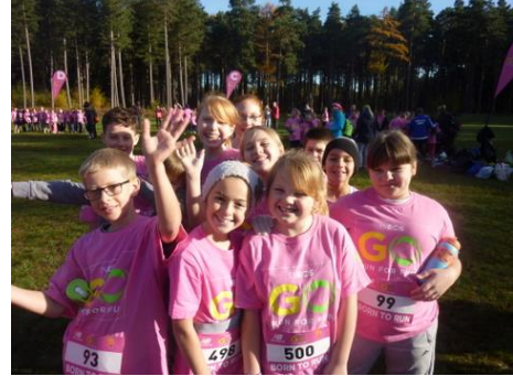
Trying wheelchair basketball, medal winners at sports day (mixed age teams) and Sherwood Pines fun run

f) There is a procedure, agreed by Mitre Trust for dealing with any complaints about the school curriculum and other related issues. A copy of the full complains procedure is available for reference in school and on the website.