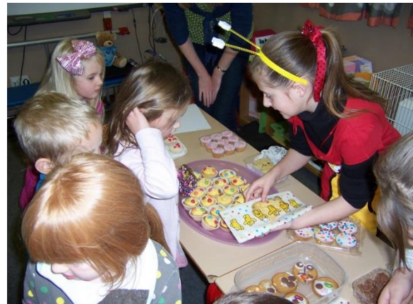
Fundraising in support of Children in Need and Comic Relief