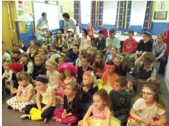
Children 'dressed for a decade' to celebrate our centenary

We run occasional sports clubs and forest school sessions during school holiday periods in partnership with Express Coaching and Moss to Canopy. Full time holiday care may be available in Southwell or through some of the local day nurseries.