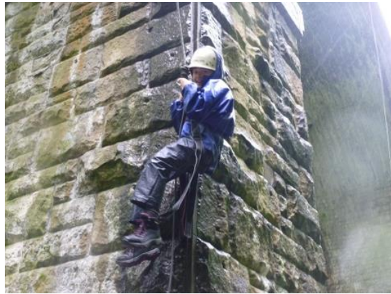
Children on residential visits in the Peak District (Hagg Farm)