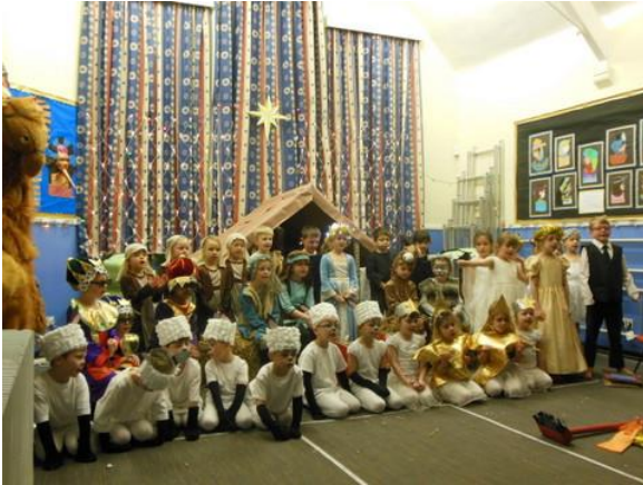
Shepherd's Delight (EYFS/KS1)

Parents are very welcome to arrange a visit to the School at any time, particularly when the School is in session, to see the children at work, examine the work on display, see the wide range of books, resources and apparatus in use, and to familiarise themselves with the school's daily life. Special arrangements can be made for parents to see a teacher or the Head Teacher in private. Please ring or email the office or Head Teacher.