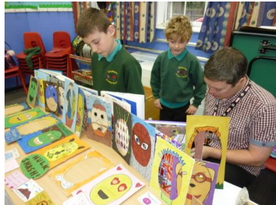
Creative learning projects – Enterprise is an annual event where pupils form their own companies to make and sell a product.

A variety of teaching methods are employed, including whole class, group work and individual tuition. The class teacher decides on the most appropriate method in order to achieve the teaching objective of each lesson through Quality First and Adaptive Teaching.