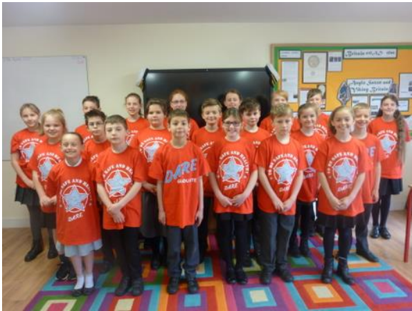
Our DARE graduates