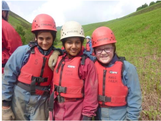
Other enrichment activities include music, drama, outdoor pursuits and regular visits linked with topics

Out of School hours the School playing field is available for use by children up to the age of 17 with the supervision of their parents. This can be made available through the parish council who oversees access outside school hours.