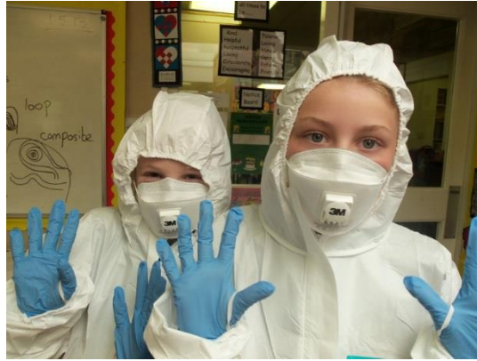
Children engaged in a CSI workshop