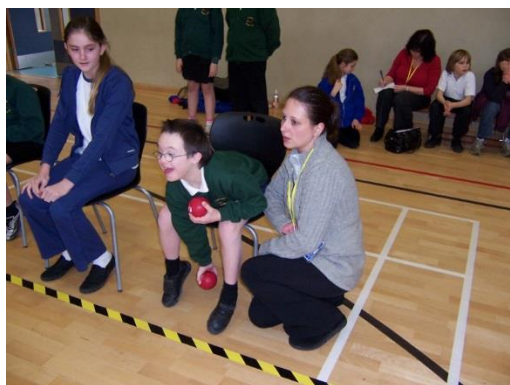
Playing together: mixed age teams on sports day and inclusion sports at the Minster School