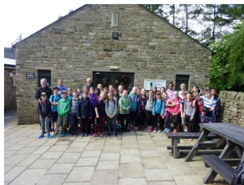
Making new friends for the future