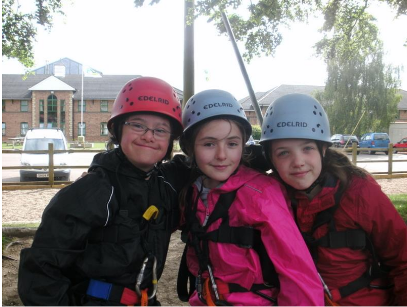
Learning together in a secure and caring environment

We have a policy for meeting the needs of pupils with special educational needs whether the child has a statement of special educational needs or not. The policy includes information about the school's processes and procedures. A copy of the full policy is available in school or on the school website.