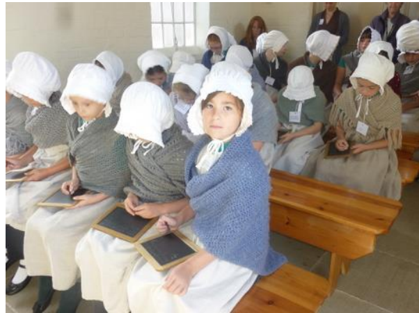
Southwell Workhouse visit