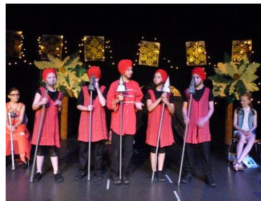
Scenes from 'Ali Baba & the Bongo Bandits', performed at the Minster School theatre