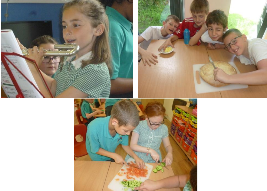
The school places high importance on the use of cross curricular themes.

There are six qualified teachers on the staff, four of whom are full time, and two who are part time. There are also seven Teaching Assistants (TAs), four full time and three part time. Our teaching assistants are deployed across the school as required to support teaching staff with their classes or to work on intervention with individual pupils or small groups.