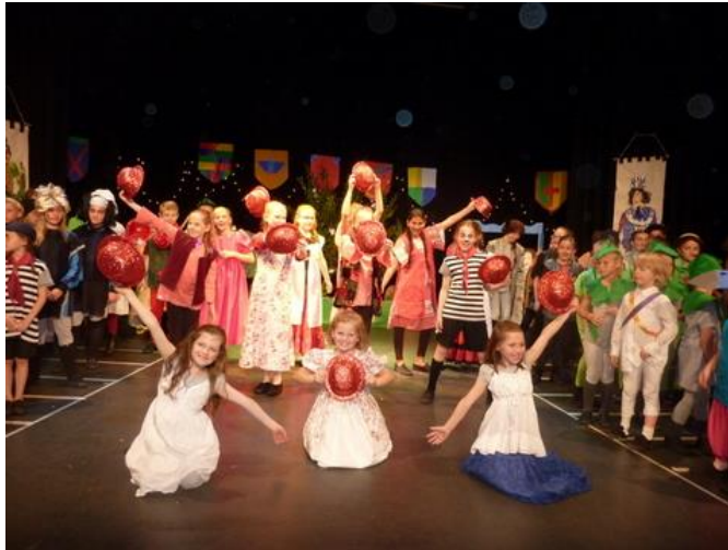
The finale of 'Robin & the Sherwood Hoodies'

We would also like parents to send children to school with a handkerchief or tissues.