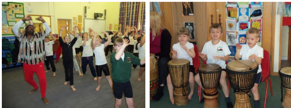
African dance and drumming workshops

Overall, the significant majority of our pupils respond positively to our high expectations of them as young citizens.