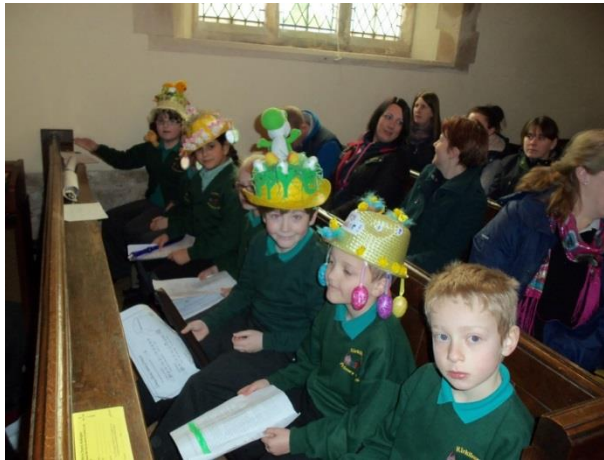
Easter celebrations in St Swithin's Church, Kirklington.

The school is not affiliated to any particular denomination, although visits and services are held at St. Swithin's Church in the village, and children are invited to join in with prayers or have time for reflection during assemblies.